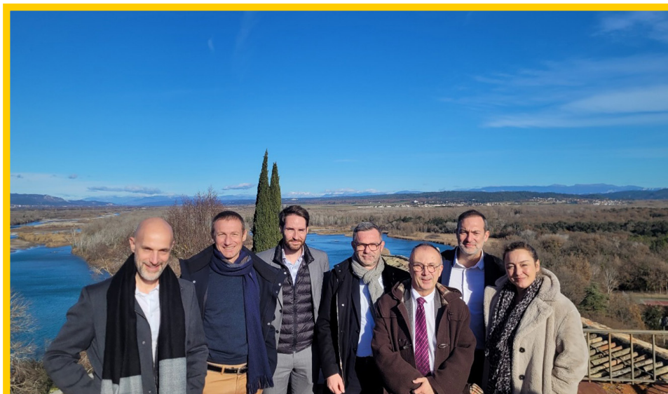
Part of the 3H Club at a strategy seminar at the Château de Cadarache on December 6, 2024.